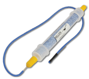
Drying Tube Assembly