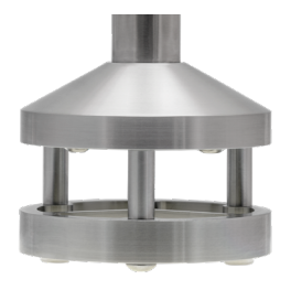
Protective Spacer (316L SS Only)