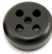
Open-faced Nose Cap