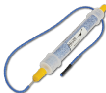
Drying Tube Assembly