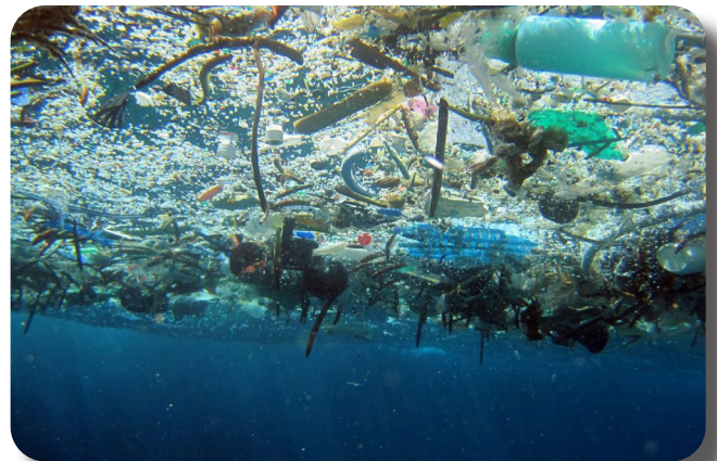
Marine Debris

devastatingly impacted. Research has shown that microplastics can shorten aquatic life span, reduce offspring and impact genetic expression.