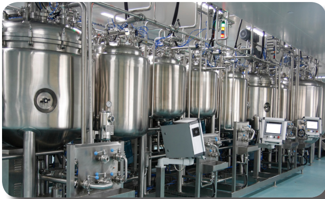
Food and Beverage Facility

The food and beverage industry is very diverse in terms of product and production methods. Non-alcoholic beverages ranging from bottled water to sports drinks, as well as alcoholic beverages and dairy. Food processing is made up of eggs, meat and poultry, seafood, fruits and vegetables for fresh, canned and frozen foods.